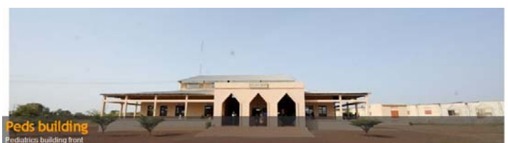
Peds building Pediatrics building front